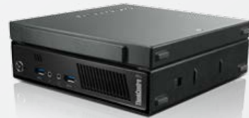
ThinkCentre® Tiny Storage Unit