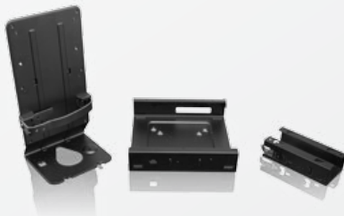
ThinkCentre® Tiny L-Bracket Mounting Kit