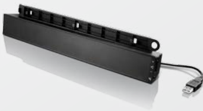
Lenovo® USB Soundbar