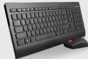
Lenovo® Ultraslim Wireless Keyboard and Mouse Combo