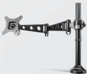
ThinkCentre® Extend Arm