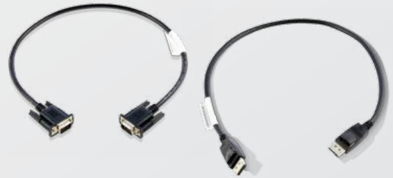
ThinkCentre® Tiny 0.5 DP and VGA Cable