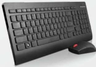
Lenovo® Ultraslim Wireless Keyboard and Mouse Combo