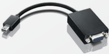
DisplayPort to Dual-DisplayPort Monitor Cable