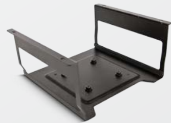
ThinkCentre® Tiny Underdesk Mount