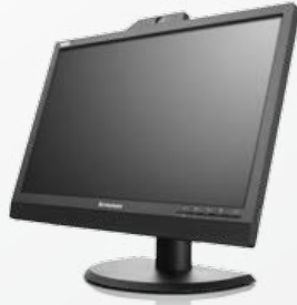
ThinkVision® LT2323z Monitor